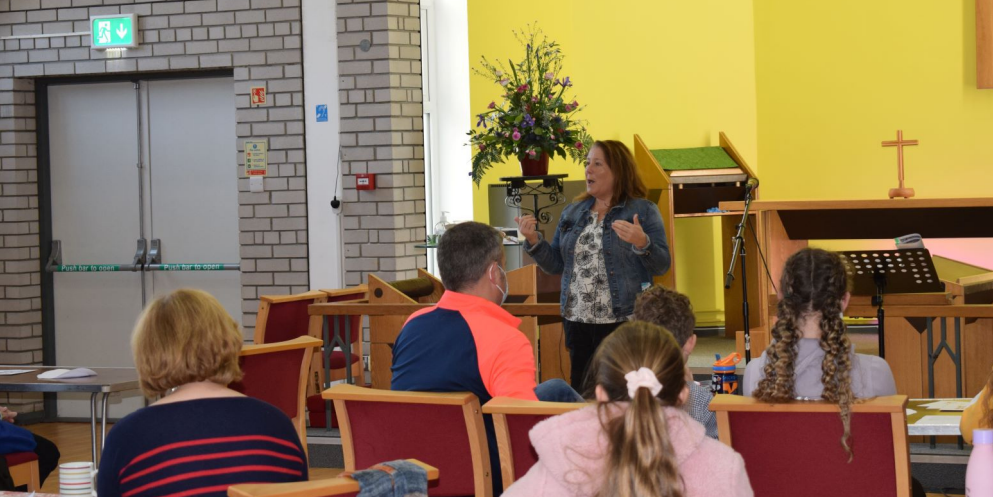
At the end of October, we had a family light party.